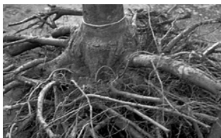
Fig.1) The wire on this tree represents the maximum depth at which the tree can be planted