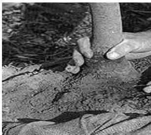
Fig.2) The excess soil can usually be removed by hand to expose the root flare.

SPECIAL NOTE: Recent studies have shown that trees and shrubs planted with their root flare below the surface of the soil are less likely to thrive and will oftentimes die - due to a lack of oxygen available to the roots, ailments associated with trunk saturation, and a host of other degenerative diseases.